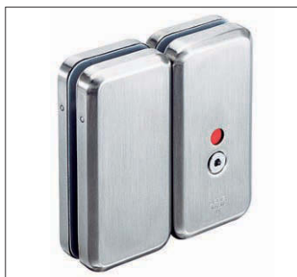
Combination Example (XL-MT120-U01 and XL-MT120-H01)